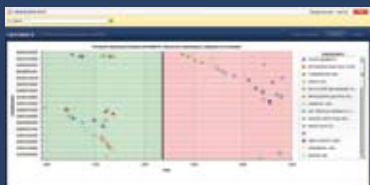
Quickly Target High-Value Licensing Candidates