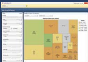
Clearly Visualize Competitive Landscapes by Portfolio Size and Company Resources